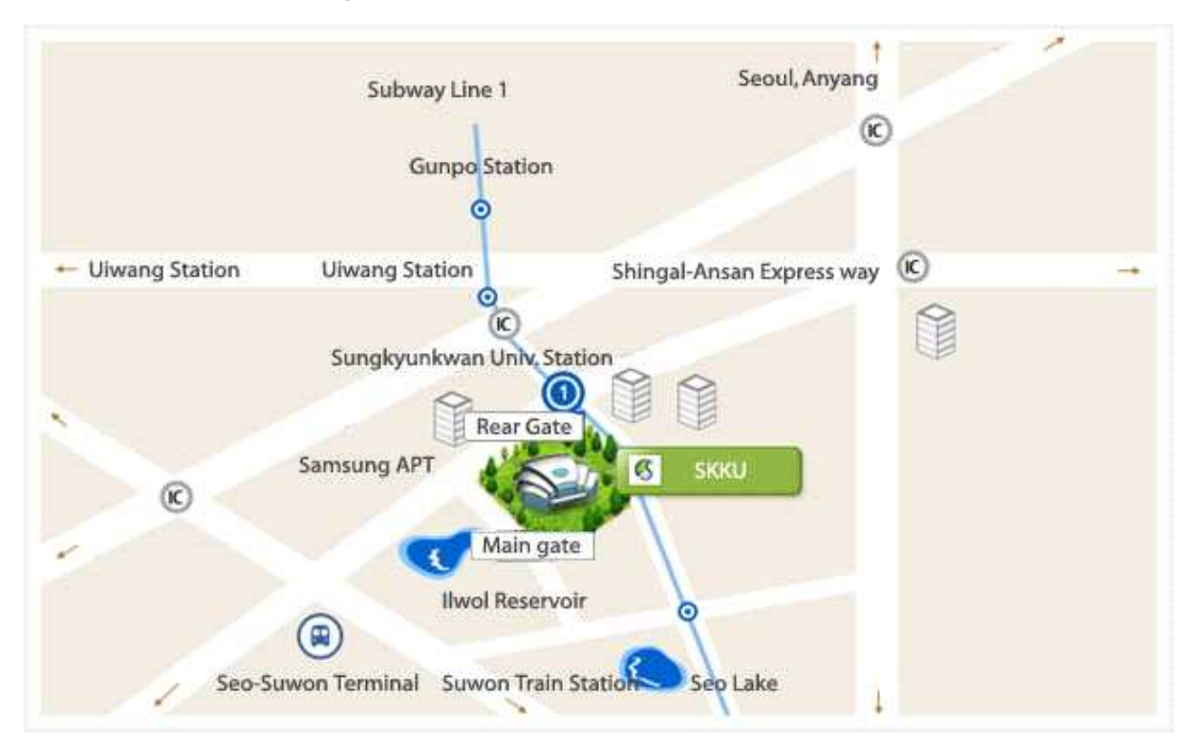
* ADDRESS: 2066, Seobu-ro, Jangan-gu, Suwon, Gyeonggi-do, Korea, 16419